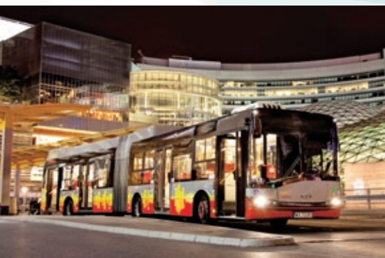
Allison hybrid city buses reduce greenhouse gas emissions

Above is the estimated savings made possible by Allison hybrid products. With more than 6,500 Allison hybrid city and coach buses on the road, the increased fuel efficiency and reductions in greenhouse gas emissions directly address the global challenges facing the commercial vehicle industry.