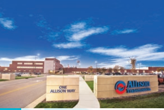
Allison Transmission headquarters (note: solar parking lot lighting)