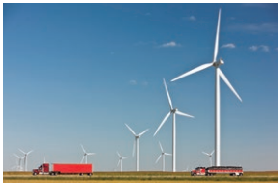
Allison purchases electrical power from wind generating facilities