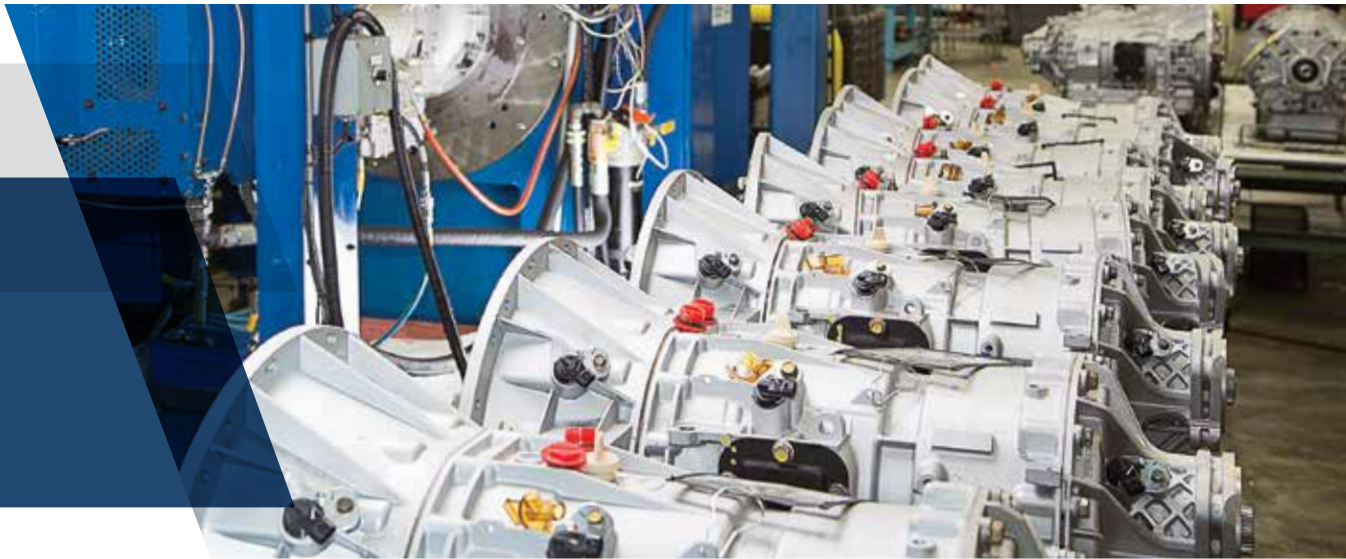
Since the inception of the ReTran program, nearly 450,000 Allison ReTran remanufactured transmissions have been reborn.